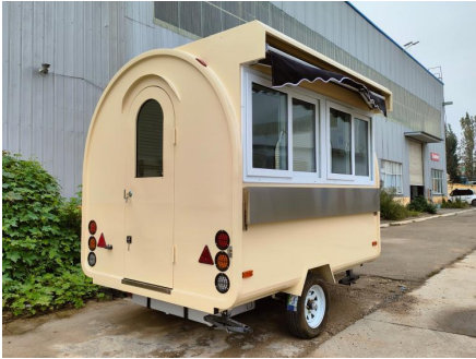
- Side -