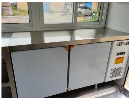
- Fridge -