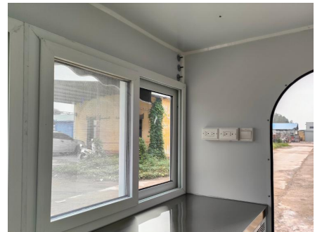
- Window -