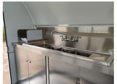
- Sink -