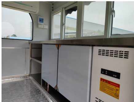
- Interior -