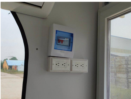
- Electrical System -