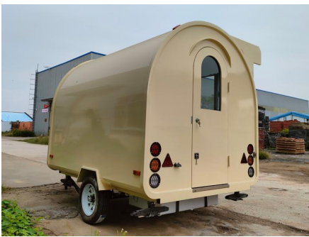
- Rear -